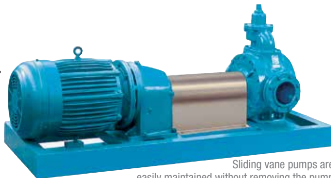
Sliding vane pumps are easily maintained without removing the pump from the piping system.