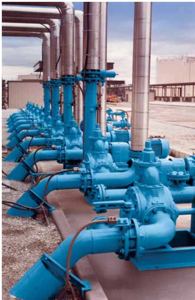
Sliding vane pumps have been designed for the high-volume transfer of non-corrosive liquids ranging in viscosity from thin solvents to heavy oils.

fracturing. The states with the largest increases (in production) are Texas and North Dakota."