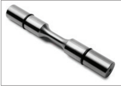
Wilden® Pro-Flo® SHIFT Air Control Spool

ment. Pump manufacturers realize the importance their products play in industry and have taken great pains to design and develop pumping equipment that satisfies the increased need for energy efficiency and reduced operating costs.