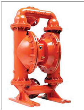
Wilden® PS800 Series Pump

So, while AODD pump operation has come a long way in terms of air consumption, thanks in large part to the invention of the signaled ADS, test pumps fitted with data-acquisition equipment show that air is still being wasted due to overfilling and that there is the potential for additional energy-saving gains to be realized.