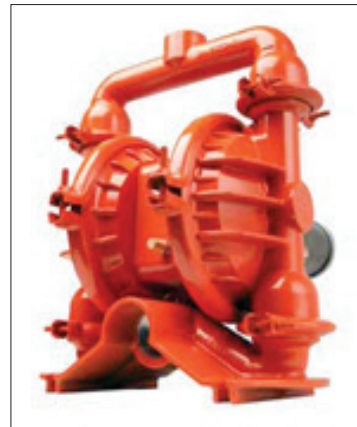
Wilden® PS4 Series Pump

Most recently, a new generation of ADS has attempted to eliminate overflowing in AODD pump operation. This next-generation ADS technology claims to prevent overflowing by cutting off the air supply to the air chamber before the end of the pump stroke.