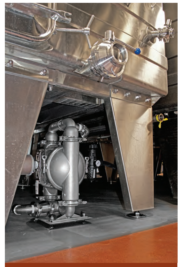
Wilden<sup>®</sup> PS8 Saniflo<sup>™</sup> FDA pumps equipped with the Pro-Flo<sup>®</sup> SHIFT Air Distribution System (ADS) and Full-Stroke Integral Piston Diaphragm (FSIPD) provide maximum cleanability and energy savings for cap irrigation at Rodney Strong Vineyards.

Sanitary practices are critical in all winemaking operations, and pumps that move wine are required to comply with FDA CFR 21.177 standards. Wilden Saniflo FDA pumps feature 316 stainless steel wetted parts with an Ra 1.3 \mu m (51.2 \mu in) interior polish that fully meet FDA standards.